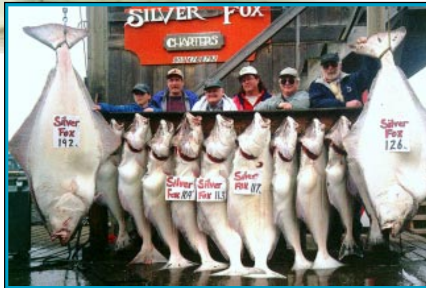
June 27, 1996 - 1,110 pounds total The Clyde family hooks 5 over 100# and the next day they went out again and brought in a 747# total with another 150 pounder

The "GUSTO" was custom built to my specifications on the hull mold of the Glasply 30 especially for the Gulf of Alaska, Cook Inlet halibut charter fishery with safety, speed, convenience and roominess in mind. She's powered by twin Volvo TAMD41 200 HP turbo diesels delivering a 27 mph (23 knot) cruising speed to get us to those distant fishing holes fast ("less time running - more time fishing"). Navigation equipment includes Radar, GPS (Satellite Navigator) with Plotter and Differential Receiver (for 30' position accuracy), Loran C, Video Fathometer, 2 VHF Radios, and a CB Radio. Inside there's plenty of seating as well as a large storage area to keep those bags and coolers out from underfoot. Also a full stand-up head with fresh water.